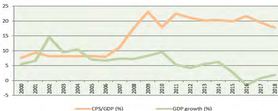
Figure 1: Financial Depth and Economic Growth