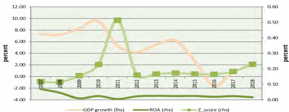
Figure 2: Financial Fragility and Economic Growth